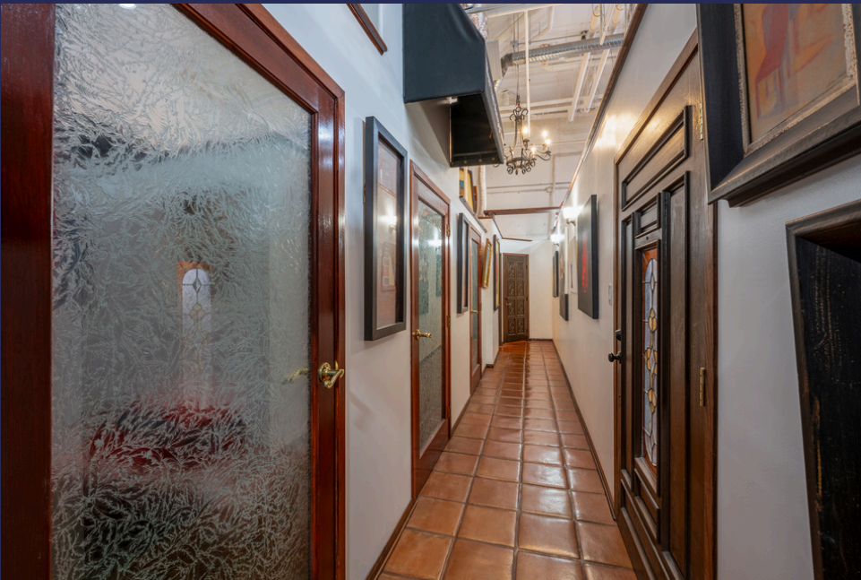
4 OFFICE / STORAGE ROOMS + RESTROOM