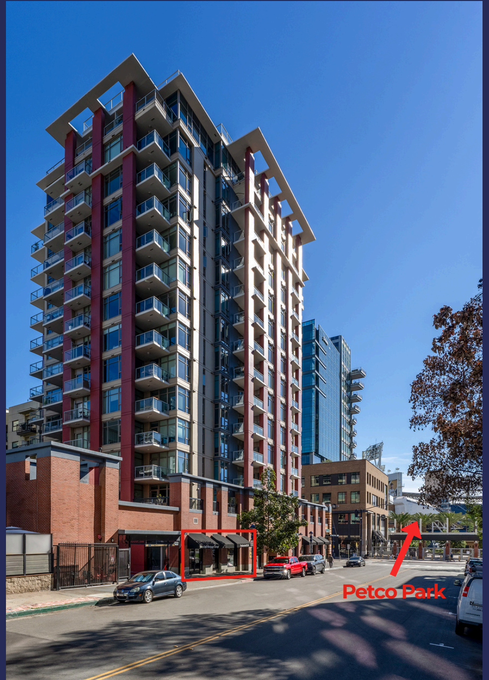
GROUND-FLOOR OF 113 RESIDENTIAL UNITS & CO-TENANT WITH 7/11 + RESTAURANTS