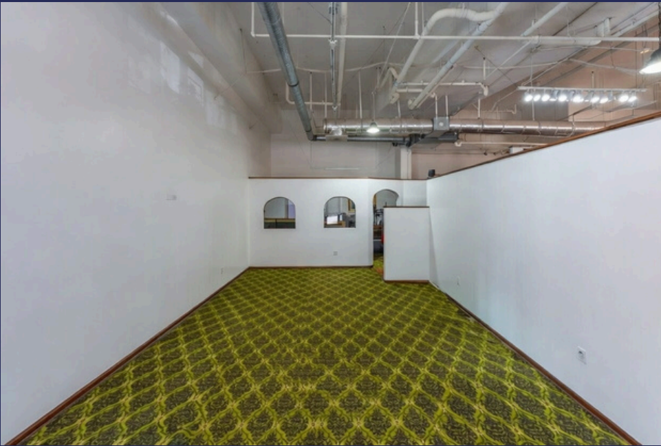
750 SF OPEN-SPACE WITH PRIVATE ENTRANCE