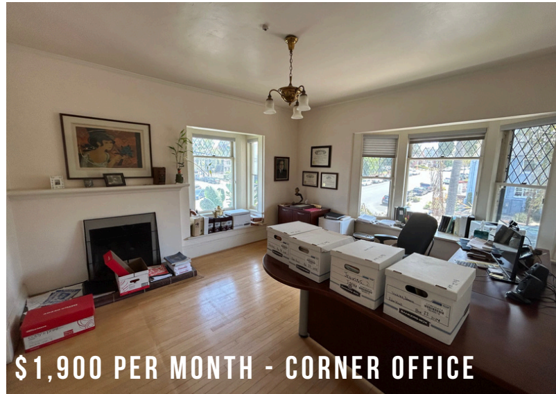
$1,900 PER MONTH - CORNER OFFICE