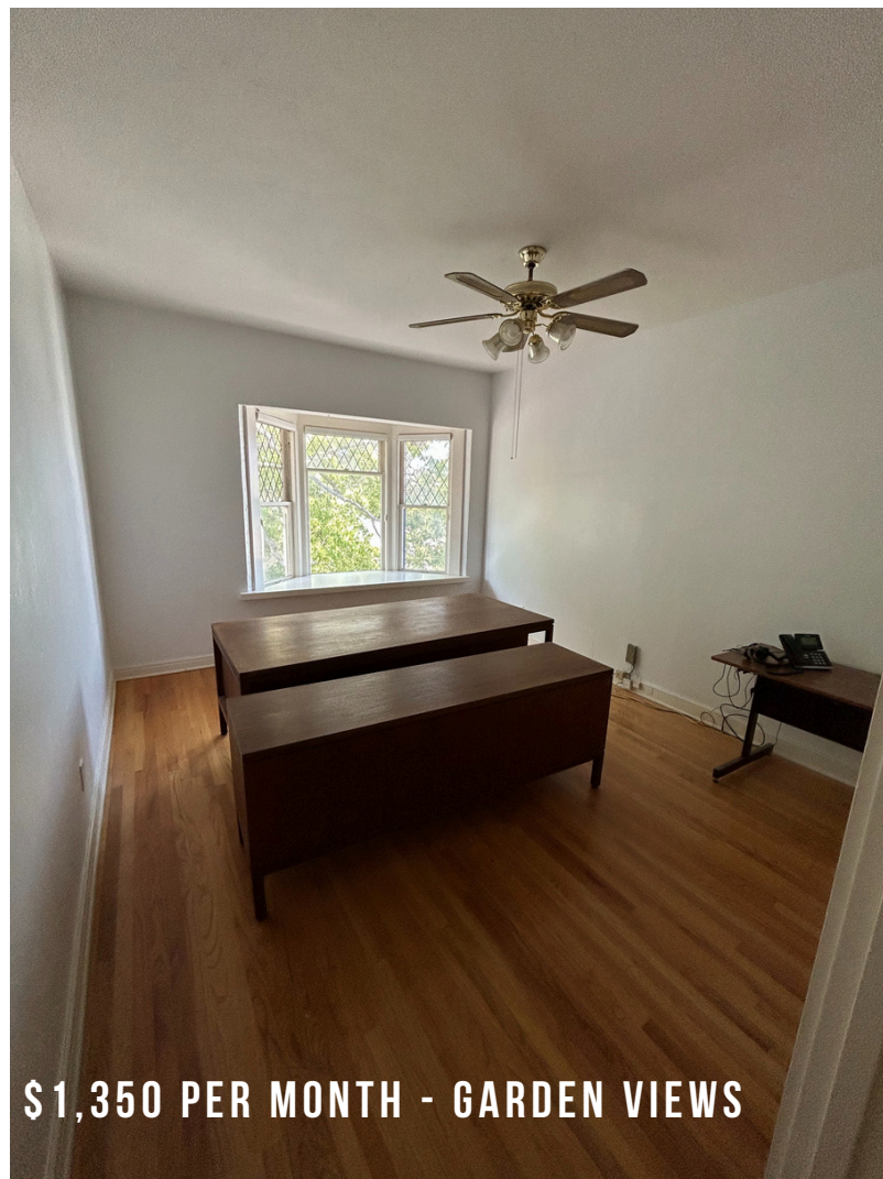
$1,350 PER MONTH - GARDEN VIEWS