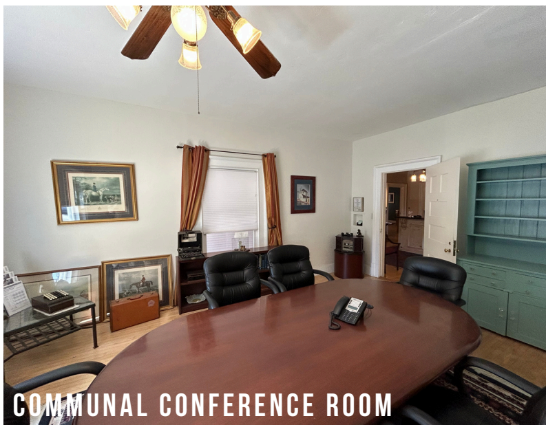
COMMUNAL CONFERENCE ROOM