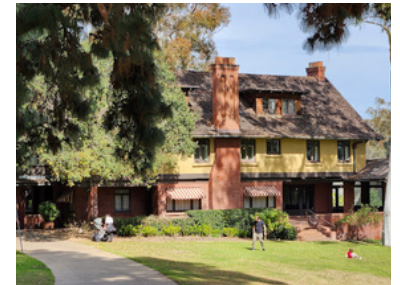
Marston House Balboa Park Icon