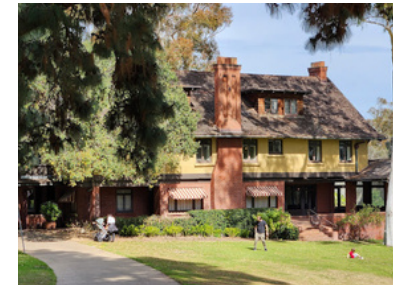
Marston House Balboa Park Icon