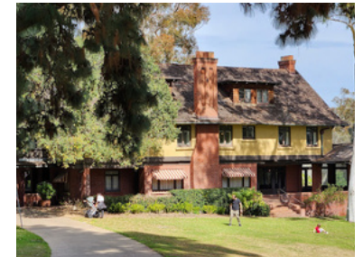
Marston House Balboa Park Icon