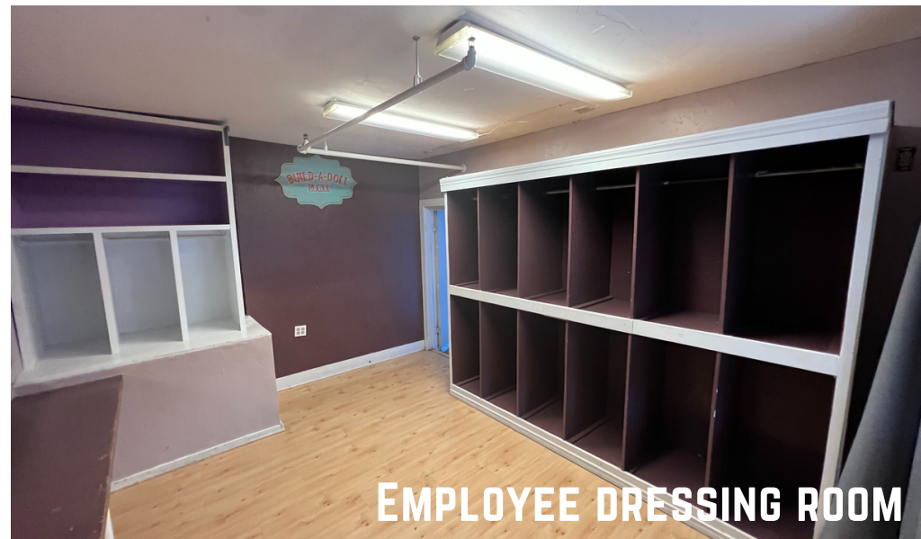
EMPLOYEE DRESSING ROOM