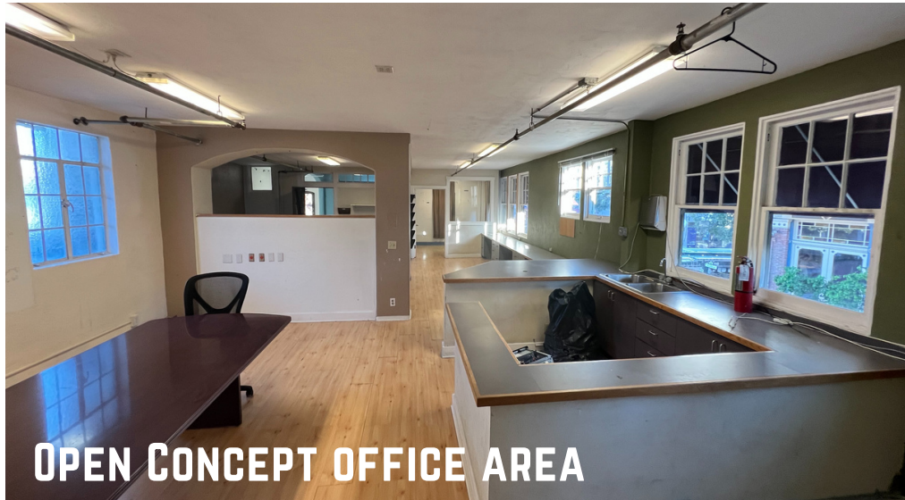
OPEN CONCEPT OFFICE AREA