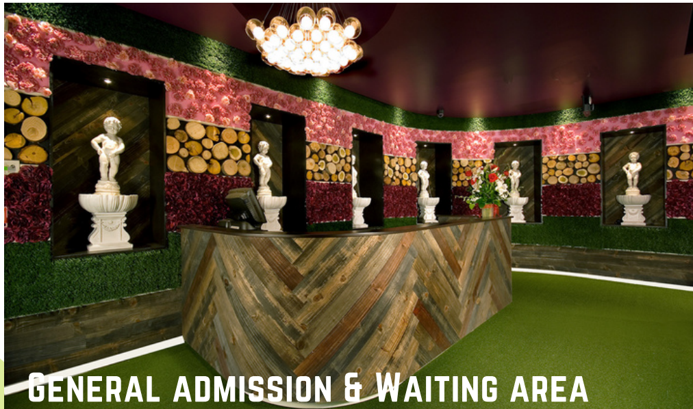
GENERAL ADMISSION & WAITING AREA