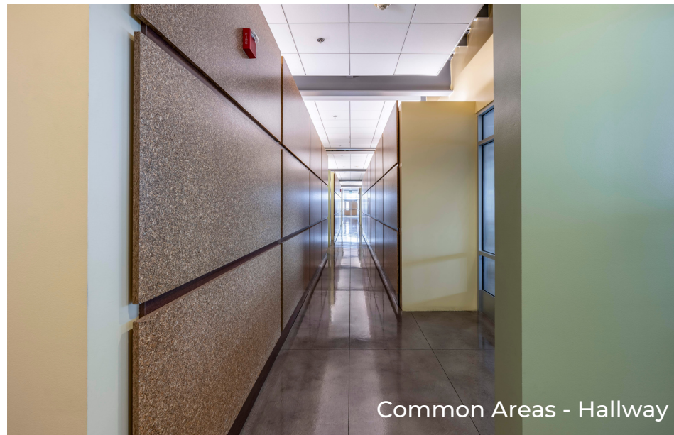
Common Areas - Hallway